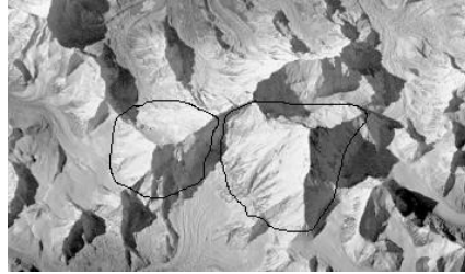
Figure 1: Left: a partition, with cells Everest , Lhotse and The Himalayas . Right: A part of the Himalayas seen from space, with Mount Lhotse (left) and Mount Everest (right).

The de dicto view of vagueness goes hand in hand with the doctrine of supervaluationism [5], [3], which is based on a redefinition of the notion of truth to accommodate the multiplicity of candidate precisifications associated with vague names or predicates. The basic idea is that, when determining the truth of an assertion containing a vague name or predicate, it is necessary to take into account all its candidate referents or extensions. In order to evaluate such an assertion semantically, we must effectively run through these candidates in succession and determine, for each particular choice, whether it makes the assertion true or false. An assertion such as 'Yul Brunner was bald' is supertrue because it is true for all such choices. An assertion such as 'Bill Clinton is bald' is superfalse because it is false for all such choices.